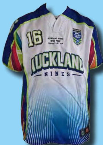
5x 2016 9s Shirts Large