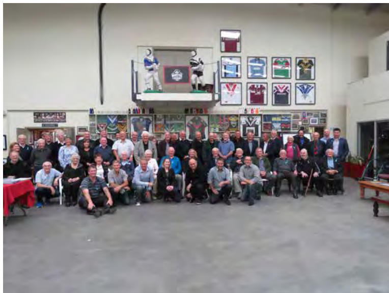
Everyone who attended the function.