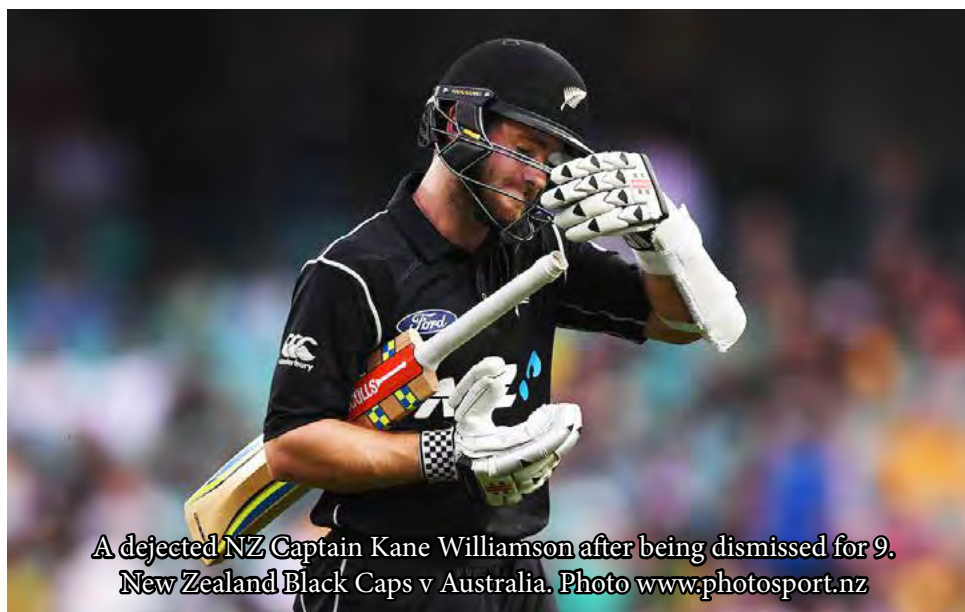
A dejected NZ Captain Kane Williamson after being dismissed for 9. New Zealand Black Caps v Australia.

We've seen in the last few months India finally accepting the use of the DRS in their matches so it's utilization won't be going away in a hurry. The time has now come to tweak the WAY we use it.