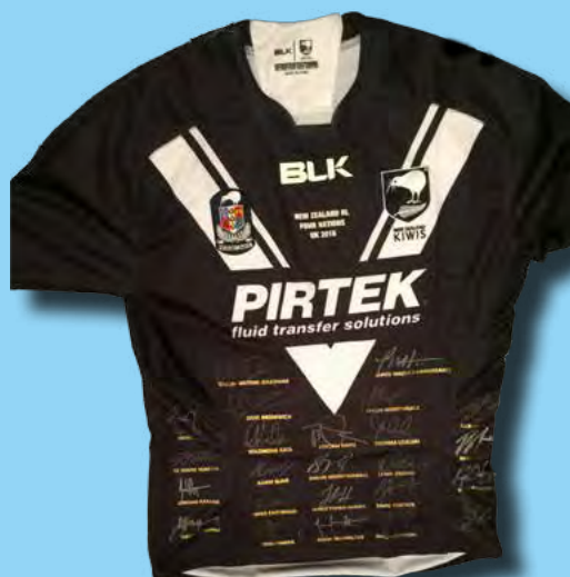
1x Signed 2016 Kiwis Jersey (Signed by Kiwis Squad)