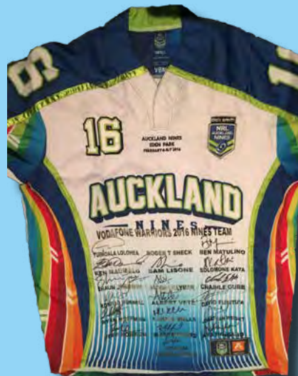
1x Signed 2016 9s Shirts (Signed by Warriors Squad)

Giveaway P.O Box 54295 The Marina 2144, Manukau, Auckland New Zealand