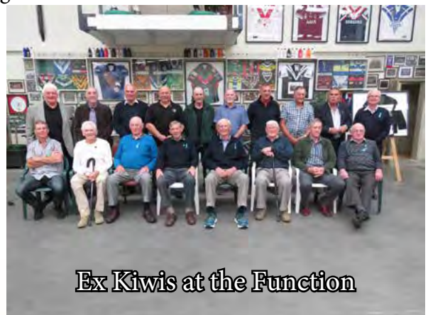
Ex Kiwis at the Function

The 2017 World Cup is an event arguably unprecedented in New Zealand Rugby League history in terms of size and exposure, but the tireless efforts of the legends who have nurtured the game in this country for almost 110 years have certainly not been forgotten.