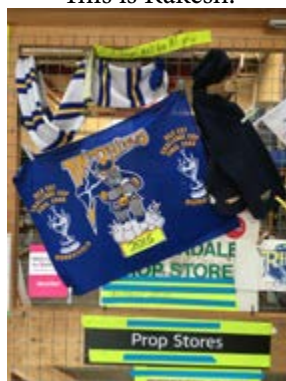
Great to see the crew supporting their local Rugby League team the Rinos.