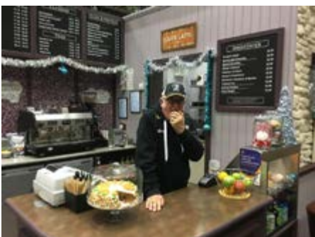
The famous Emmerdale Cafe.