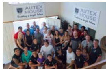
The grand opening.