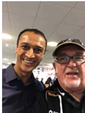
This is Chris Bisson aka Jai Sharma another bad boy on the show.