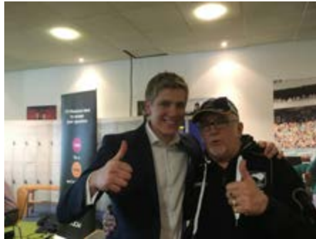
Look who I found its Ryan Hawley aka Robert the bad boy on the show.