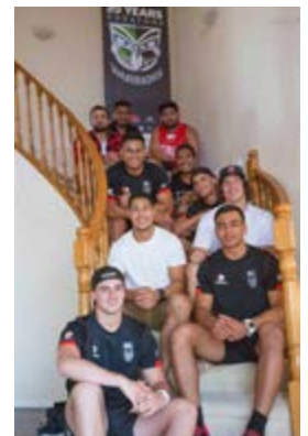
The guys try the steps out.

Autex House Opening