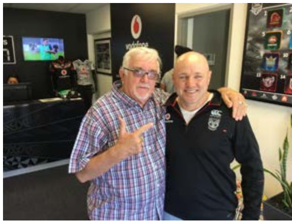
Catching up with Coach Cappy.