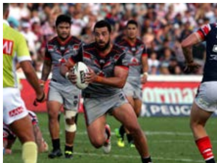
Ben Matulino on the run past Mitchell Aubusson