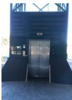
The Elevator to meet by.

Interested in a tour of Mt Smart. Then meet my mate Dexter at the back of the West Stand by the lift entrance on the ground level at 5.30pm - SPL