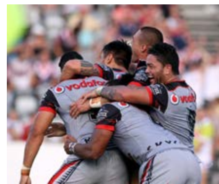
The boys celebrate their win

Mounties 50 Illawarra 16 Newtown 38 Wests Tigers 14 Penrith 50 Manly 12 Wyang 28 Canterbury 22 Wentworthville 26 NZ Warriors 14 North Sydney 24 Newcastle 10