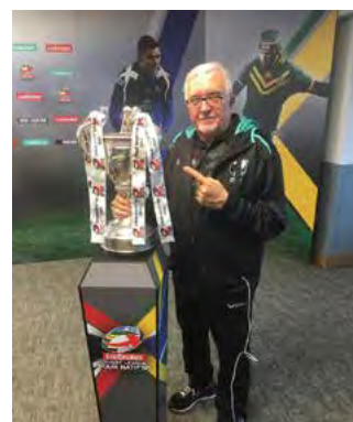
The Butcher holding the trophy at the Four Nations launch.