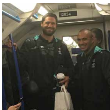
Standing room only on the train to Liverpool.