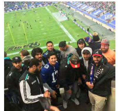
The boys at the NFL game in London.