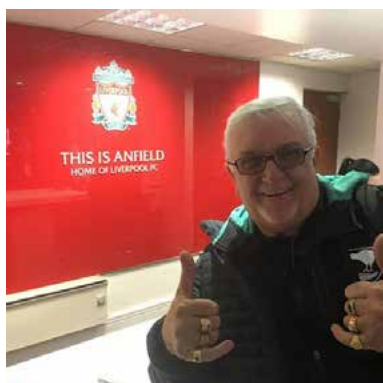
At the home of Liverpool FC Anfield Stadium.