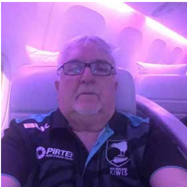
It's flight time. Air NZ will look after us on your flight to LA. UK here we come!.