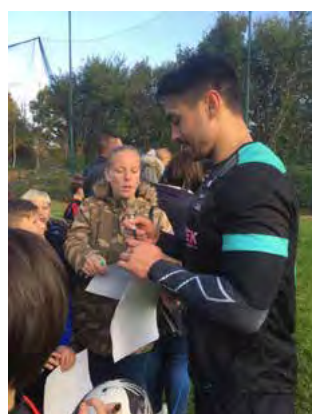
They boys signed plenty of autographs for the fans.