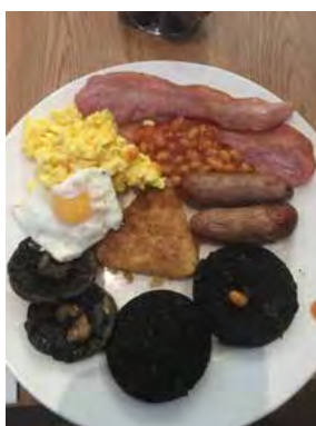
Starting the day with a full English breakfast today very yummy.