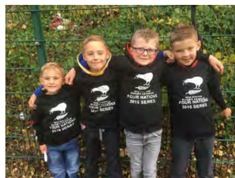
These kids Dad wanted to make the Kiwis feel welcome at training, so he got these tshirts made. They will all be getting a BLK Kiwis flag for being such awesome fans.