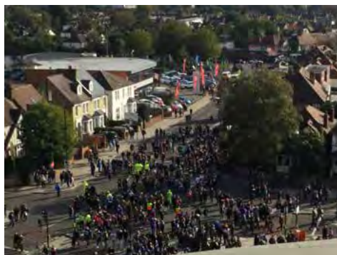
Crowd streaming into Twickenham for the NFL game.