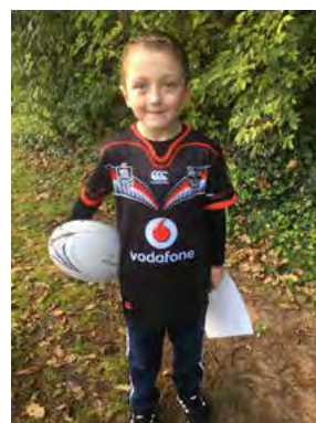
Even in Leeds UK you find Kids in Vodafone Warriors Jerseys.