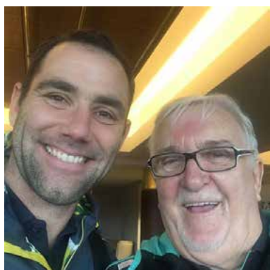
Always great to catch up with the legend Cameron Smith.