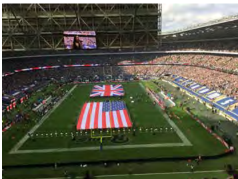
The national anthems being sung before the NFL game.