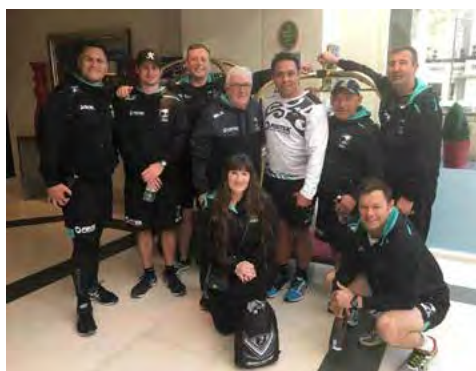
Kiwis Coaching and Management team plus the Butcher.