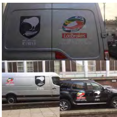
Our baggage van and staff car for our use during the Four Nations.