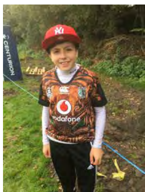
Another Vodafone Warriors fan at Leeds Rugby League training ground.