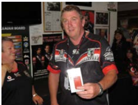
Another Panasonic Radio prize winner.