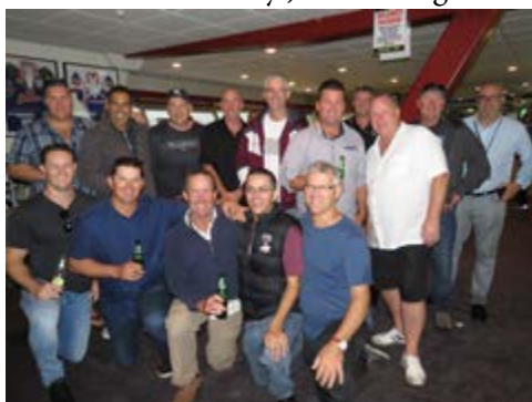
These guys all fly in from Aussie and gate crashed the Stacey Jones lounge. They were in Auckland for the races.