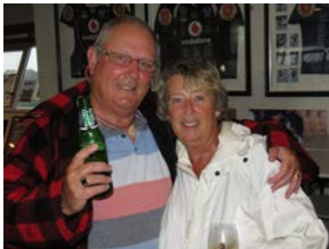
The McHues from Dorset England, by the end of the night they were wearing Warriors jerseys.