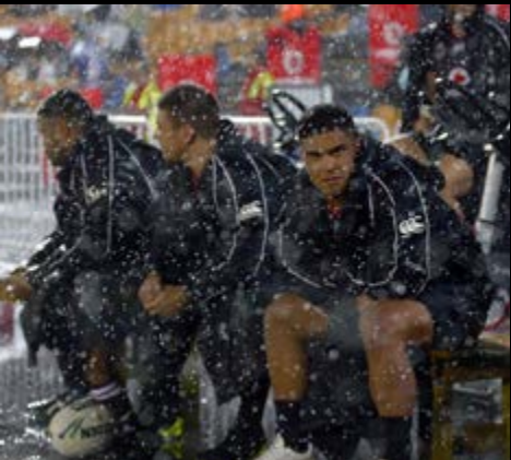
The rain comes down on the Warriors bench