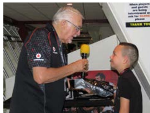
Copper receives a membership.