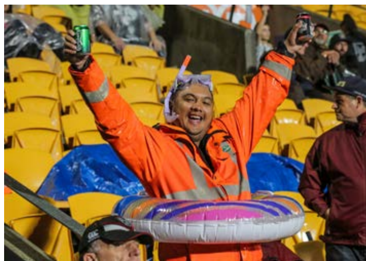
Thuis Warriors fan came prepared for the weather.