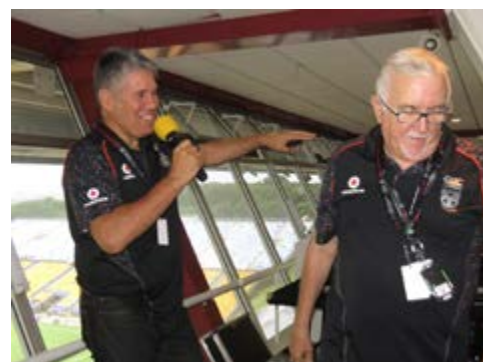
Dexter orders Sir Peter from the stage.