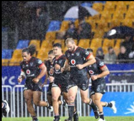
The Warriors run back from their goal line