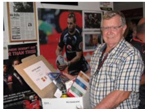
Another winner of the Don Graham Grocery Hamper.