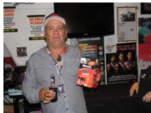
A happy winner with their Selley's BBQ Tough Kit