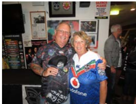
The McHugh's proudly show off their new jerseys.