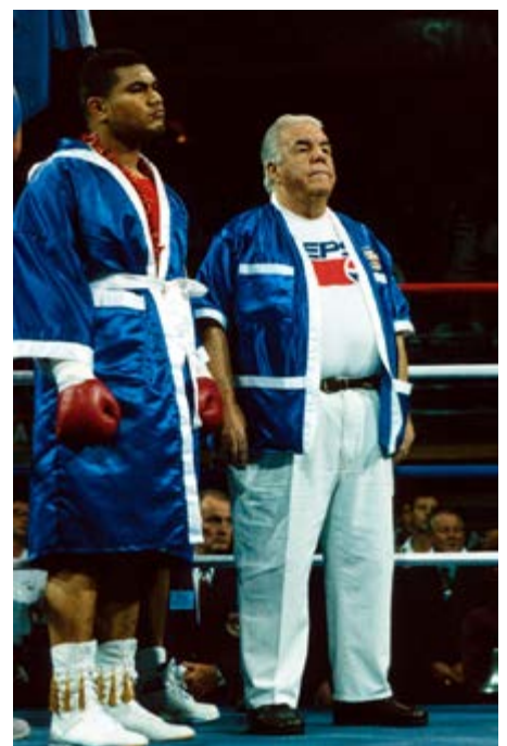
David Tua & Lou Duva 26 Nov 1993.