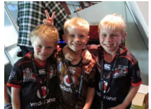
The three musketeers.