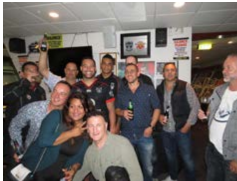
The Papanui Tigers from Christchurch.