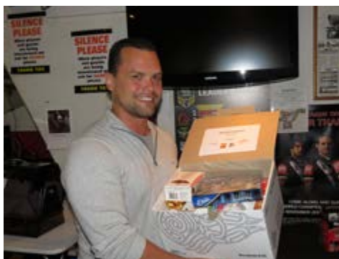
Another winner of the Don Graham Grocery Hamper.