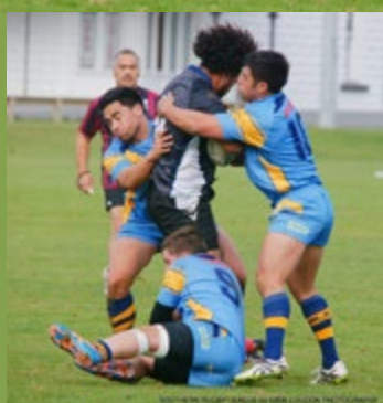
SOUTHERN RUGBY LEAGUE