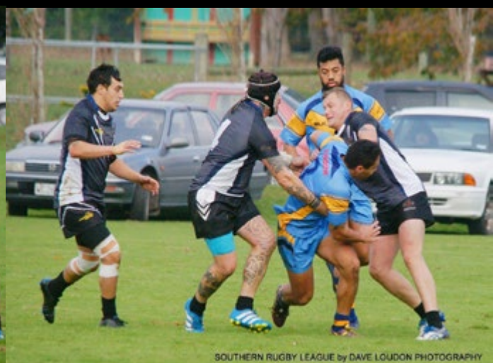
SOUTHERN RUGBY LEAGUE