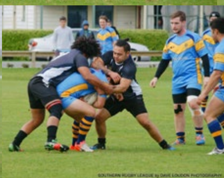
SOUTHERN RUGBY LEAGUE