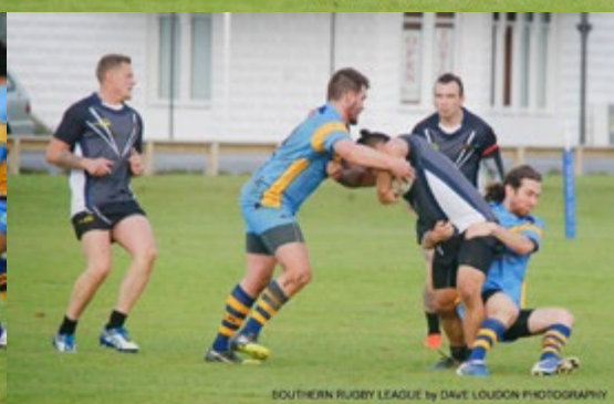
SOUTHERN RUGBY LEAGUE