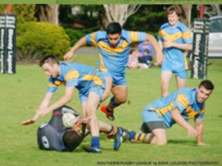
SOUTHERN RUGBY LEAGUE

P HOTOS FROM a game played at Invercargill on 13.05.17. Only one game down here this week.