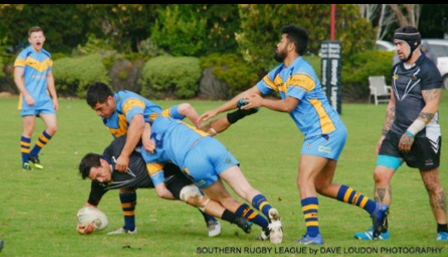
SOUTHERN RUGBY LEAGUE