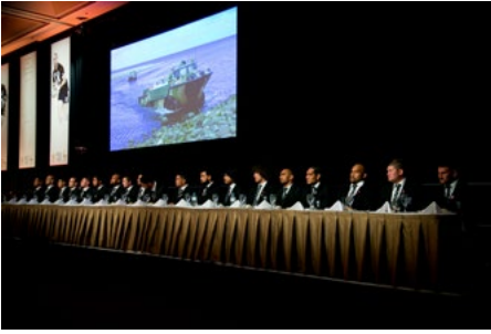
Kiwis players at their table.