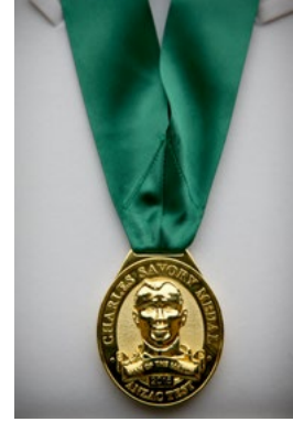
Charles Savory medal. Presented to the fairest player on the day.