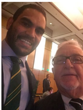
Caught up with Greg Inglis at the LUNCHEON. Top bloke.