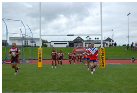
The Otago Scorpions marked their return to the Fox with an opening round loss to Papakura.