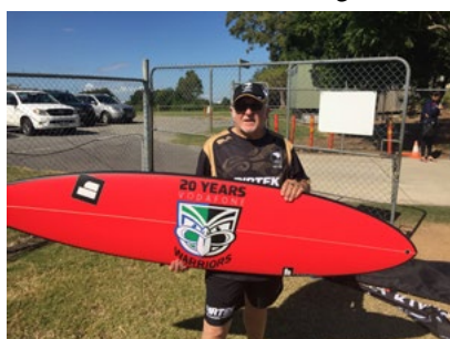
I just had to get a photo with this surf board very nice.