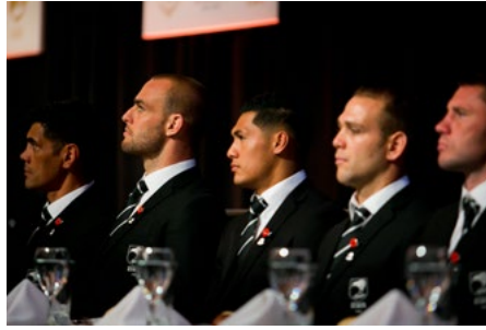
Kiwis anxiously searching for their lunch.