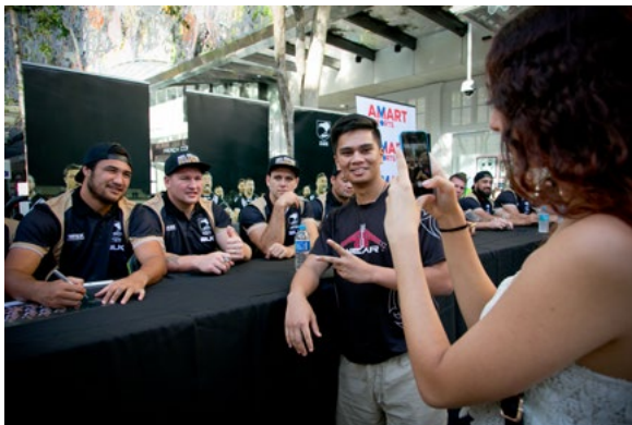
Fan taking a photo with the boys.