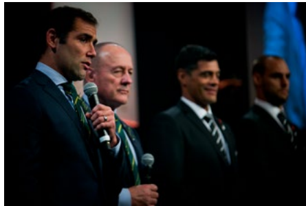
Australian captain Cameron Smith, Australian coach Tim Sheens, New Zealand coach Steve Kearney and New Zealand Captain Simon Mannering