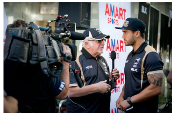
Interviewing Shaun Johnson for the NRL Footy show on Thursday on SKY TV.