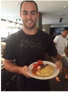
Captain Mannering having a hearty breakfast on the eve of the test.