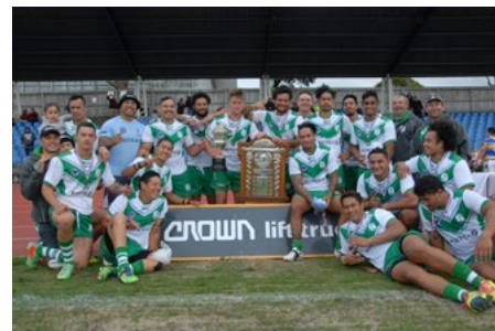
The Pt Chevalier Pirates with the Crown Lift Trucks Stormont Shield.

WE often talk about the great game of rugby league but how good is the NRL the governing body in Australia. From each ticket sold $1 will be donated to the RSL in Australia and the RSA in New Zealand. It just keeps on keeping on.