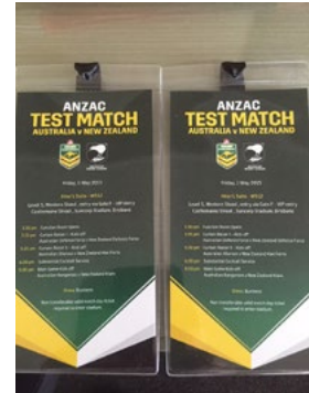
Tickets all sorted for the big game ANZAC test Brisbane this Friday.