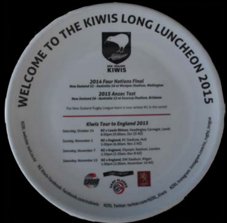
2015 Kiwis Long Luncheon Commemorative Plate