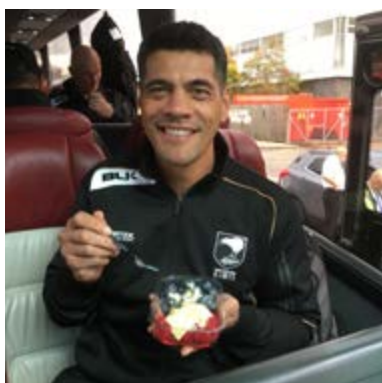
The coach chilling out on our Pitt stop on the four hour drive to Leeds.