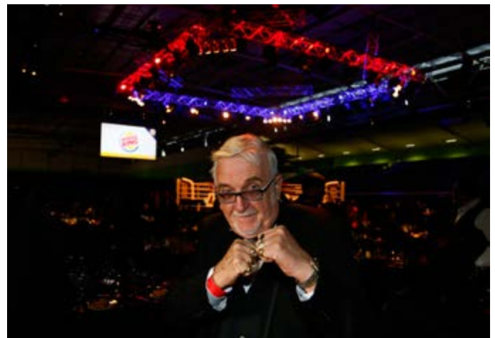
I'm ready to rumble.