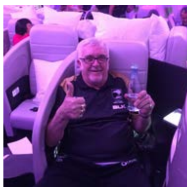
Me on the plane.