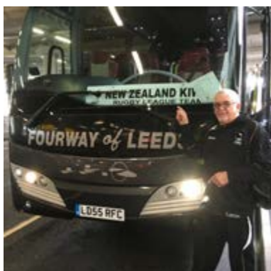
I had to check out our coach before we hoped on for the 4 drive to Leeds.