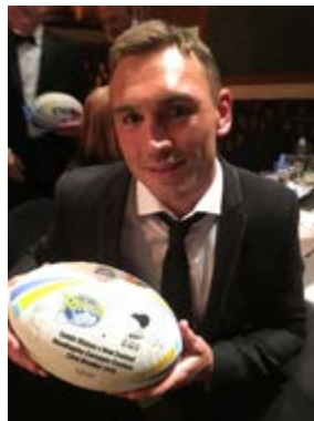
Leeds Rhinos retiring player and former captain Kevin Sinfield MBE SIGNED THE BALL FOR ME and what a top bloke he is.