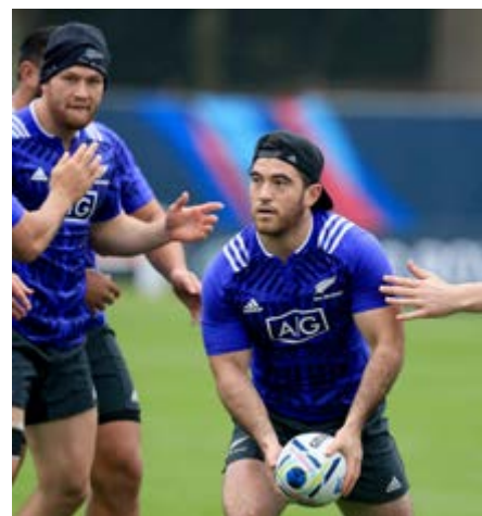
Nehe Milner-Skudder passes the ball.