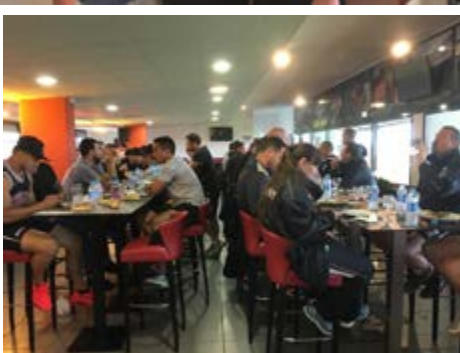
We enjoyed our lunch at the Catalan Dragons.