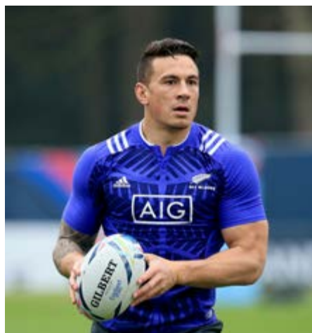
Sonny Bill Williams.