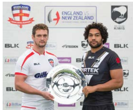
Sean O'Loughlin and Adam Blair.