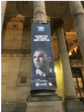
They sure did make us Kiwis feel welcome.