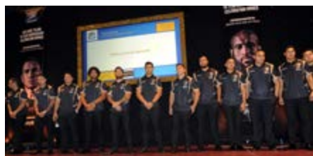
The Kiwis team on stage.