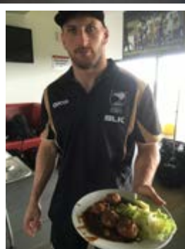
Lunch at the Catalan Dragons on the second day was a traditional Perpignan dish of pork meat bald very tasty.