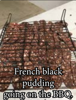
French black pudding going on the BBQ.