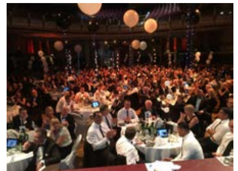
The Victoria hall room was a sell out over 400 guests.