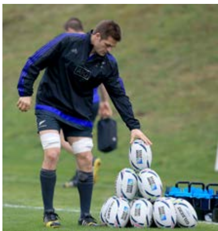
Richie McCaw chooses his ball to train with.