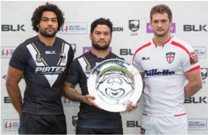
English Captain Sean O'Loughlin pictured with Co-captains Issac Luke & Adam Blair and the Albert Baskerville Shield at media launch for the upcoming test series.