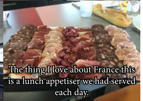
The thing I love about France this is a lunch appetiser we had served each day.