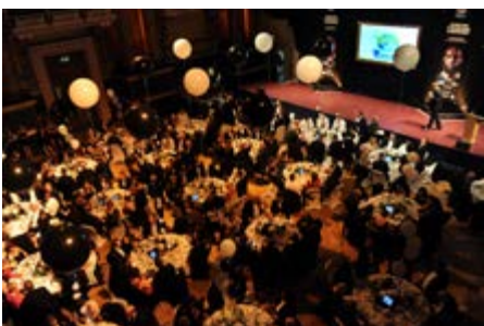
A packed house - over 400 people.