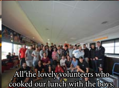
All the lovely volunteers who cooked our lunch with the boys.