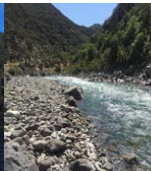
Christchurch - Hurunui Lakes Area.