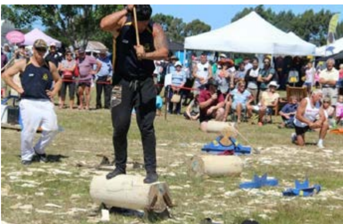
SI Axemen Championship