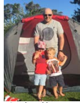
Coach and his Boys.