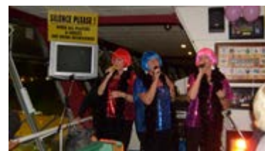
The Wai Wai Girls Waiheke Island's biggest entertainment for over 100 years performed in the lounge and had the place rocking