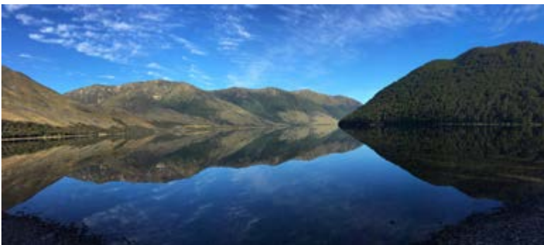
Lake Taylor in Christchurch!