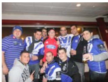
The Bulldogs always have good traveling supporters who come up to the lounge