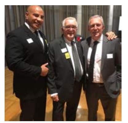
The three musketeers.