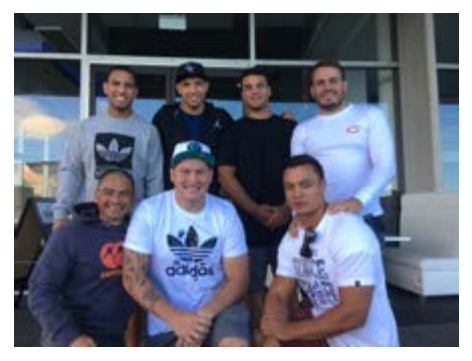
Took these Bulldogs out for lunch last Friday in Wellington (sharing the love).

Made these 2 young guys night I went out after the game a got them out of the crowd and took them into the teams changing room.