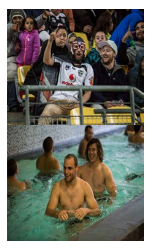
The boys cool down in the pool.