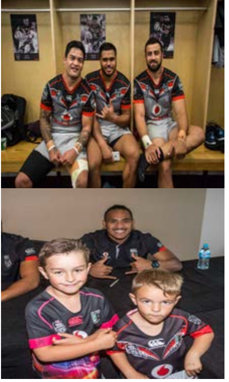
These two young boys loved the signing session at the Rydges hotel.