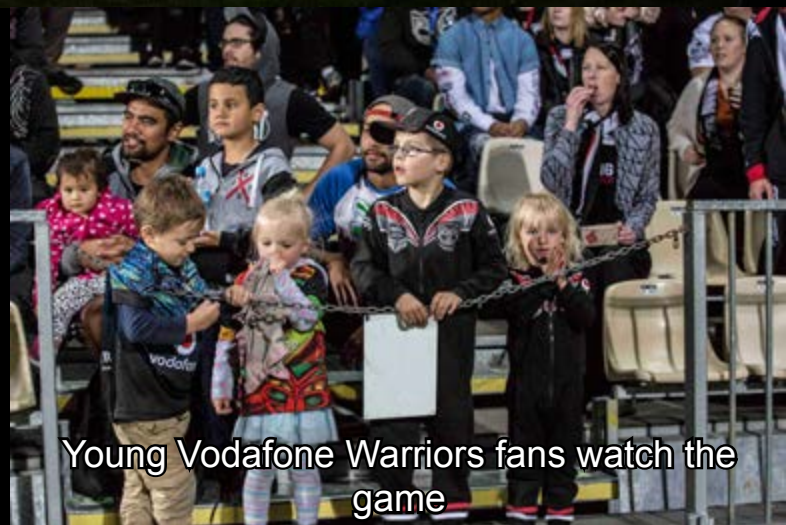
Young Vodafone Warriors fans watch the game