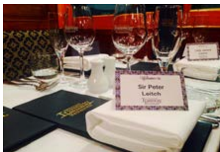
We had a lovely meal with personalised name card and fantastic service,