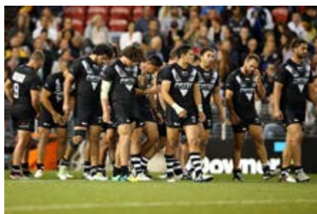
Kiwis dejected after their loss.