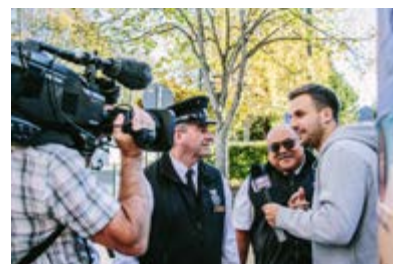
Beau filming in Christchurch