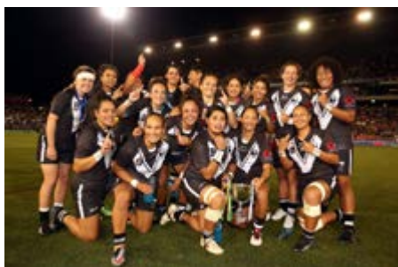
The Kiwi Ferns after their win.