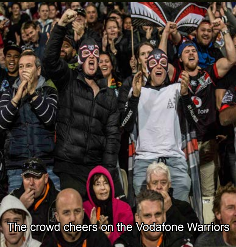
The crowd cheers on the Vodafone Warriors