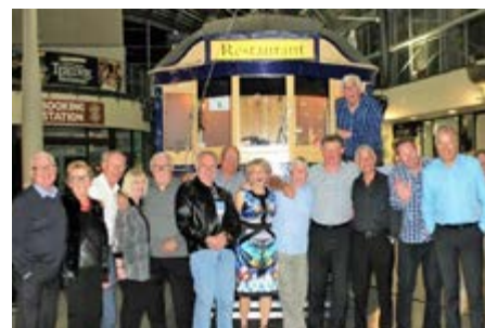
The rest of the dinner group.

Check out www.welcomeaboard.co.nz for more info on this Christchurch icon.