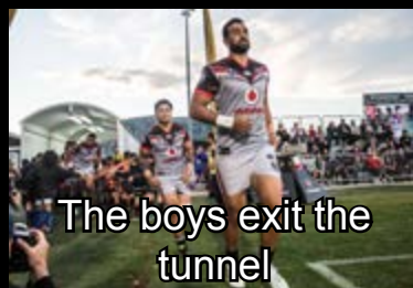
The boys exit the tunnel