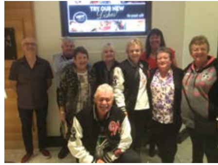
Was nice to catch up with these Sir Peter Leitch club members in Christchurch.