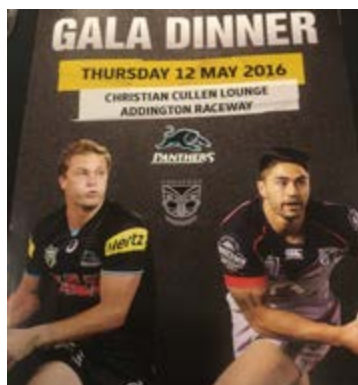
Gala dinner programme.