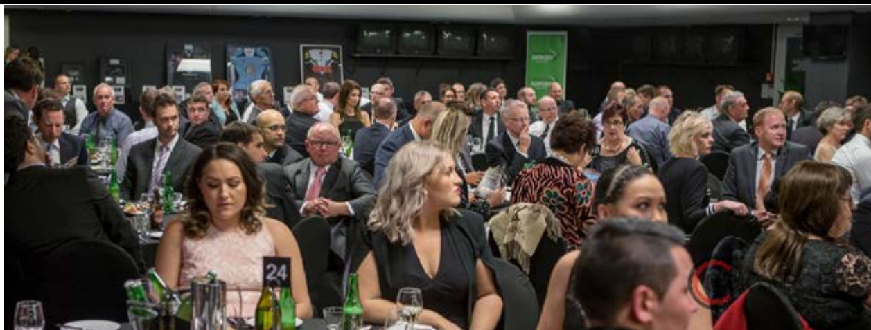
Crowd listening to the Butch interview Beau.