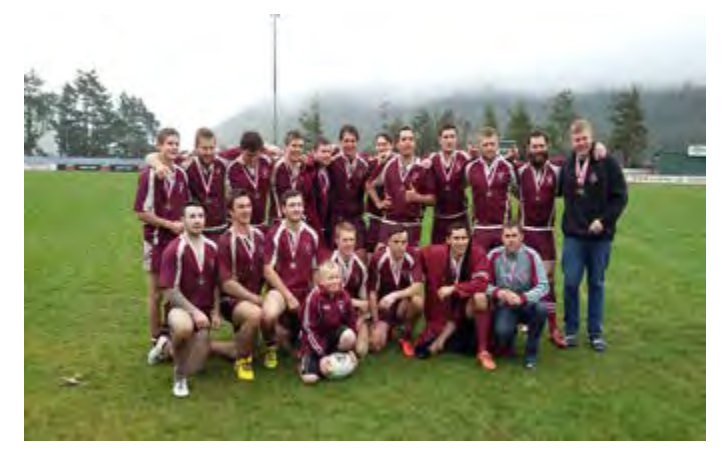
Subrubs Prem Team