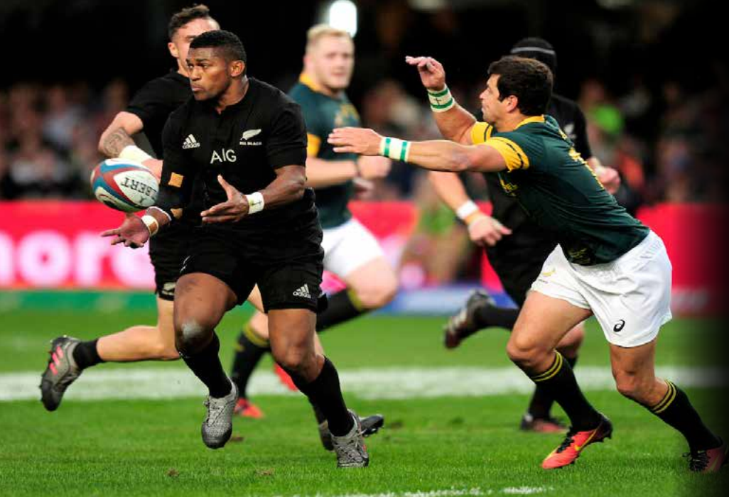
Waisake Naholo of New Zealand keeps the ball alive despite the efforts of Morne Steyn of South Africa. 8th October 2016.

T HE ALL Blacks' chance to set the world record of 18 consecutive test victories on Saturday night is something we shouldn't take for granted. The dominance they've had in recent times has led to some people suggesting they're bored of knowing the result before most of their games kick-off. After a weekend where New Zealand had shocking sports results for a handful of their teams it hopefully reminds us all to seize the moment because success like the All Blacks are currently having won't last forever.