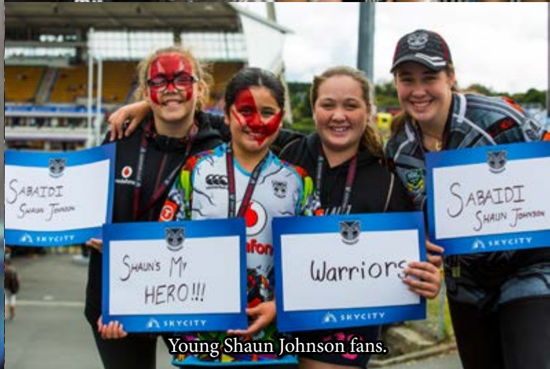
Young Shaun Johnson fans.