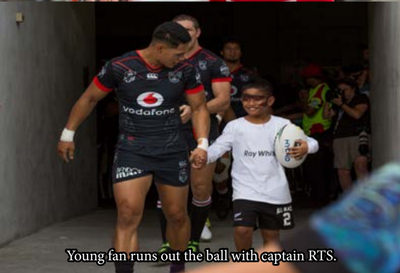
Young fan runs out the ball with captain RTS.