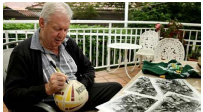
Langlands still gets some support from the NRL.