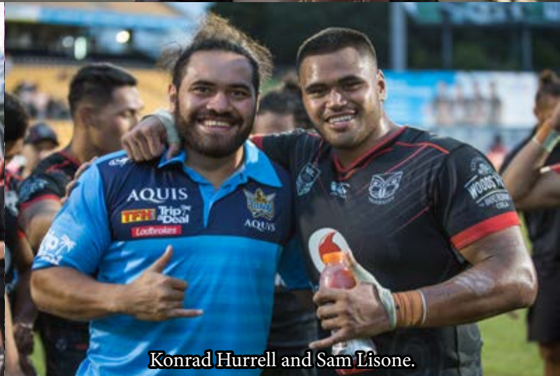
Konrad Hurrell and Sam Lisone.