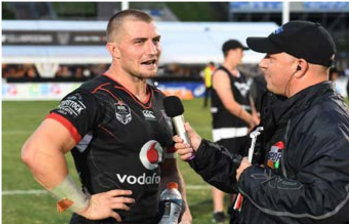
Radio Sport's Dale Budge talks to Kieran Foran while his wife is in the stands.