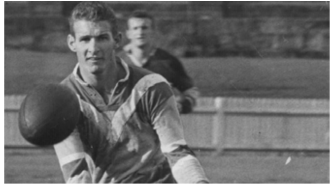
Langlands was renowned for living life to the full, on and off the field.