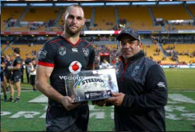
Simon Mannering receives an award for 261 games from Stacey Jones