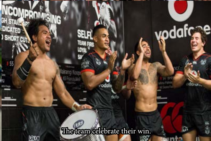
The team celebrate their win.