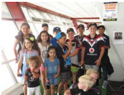
Young fans in the lounge.