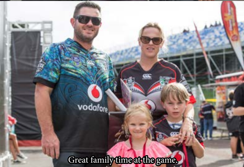
Great family time at the game.