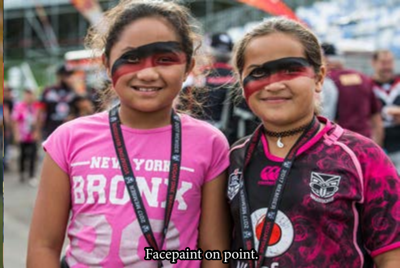
Facepaint on point.