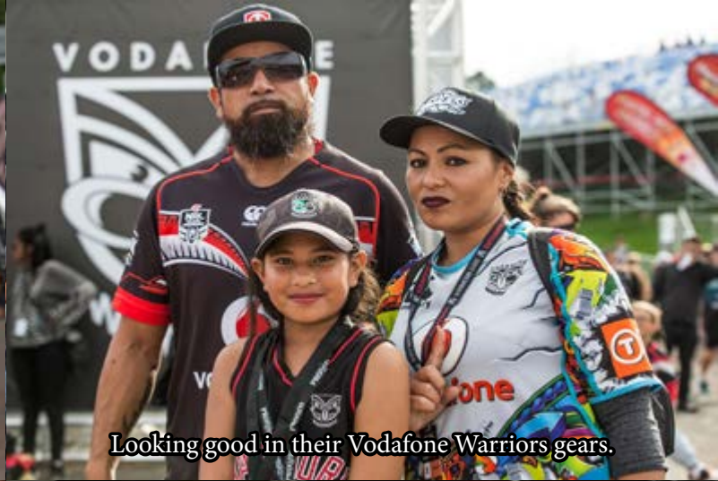
Looking good in their Vodafone Warriors gears.