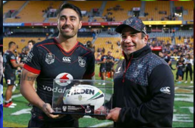
Shaun Johnson receives an award for 674 points from Stacey Jones