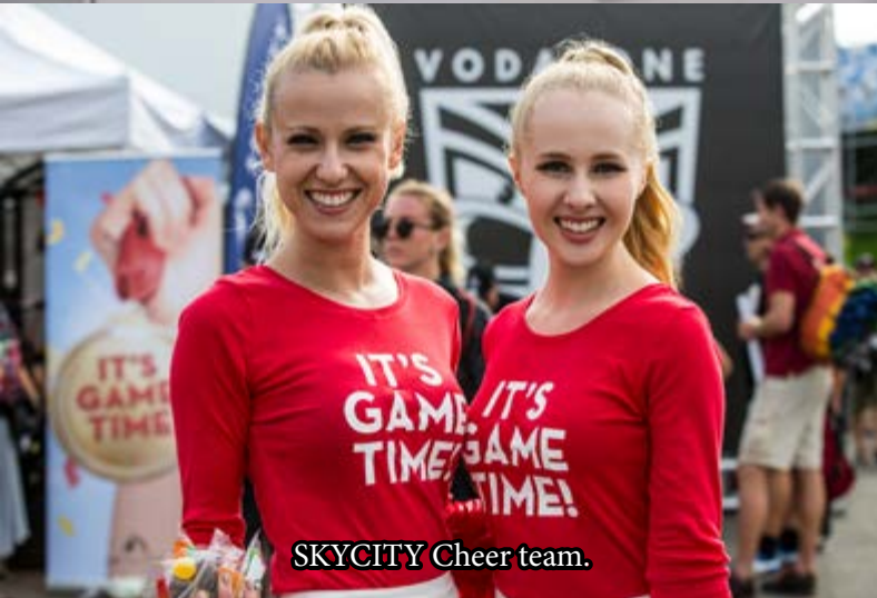
SKYCITY Cheer team.