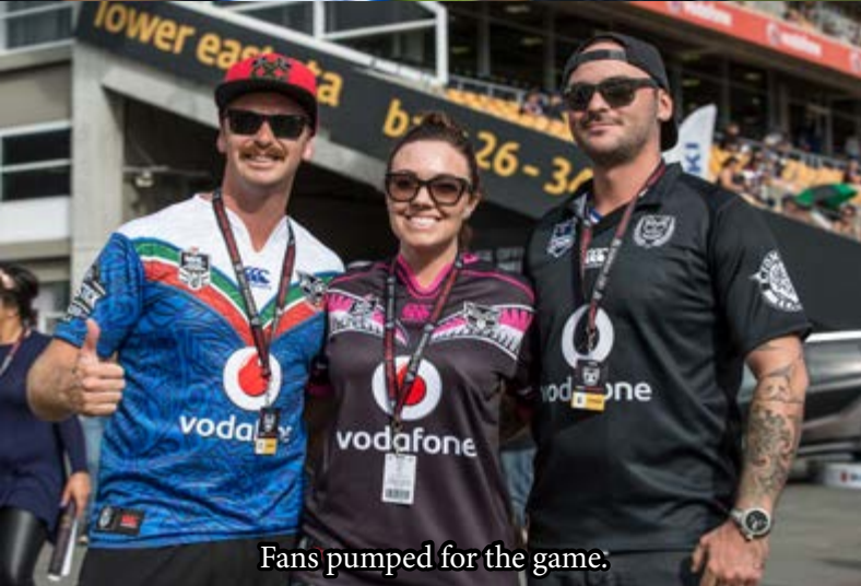
Fans pumped for the game.